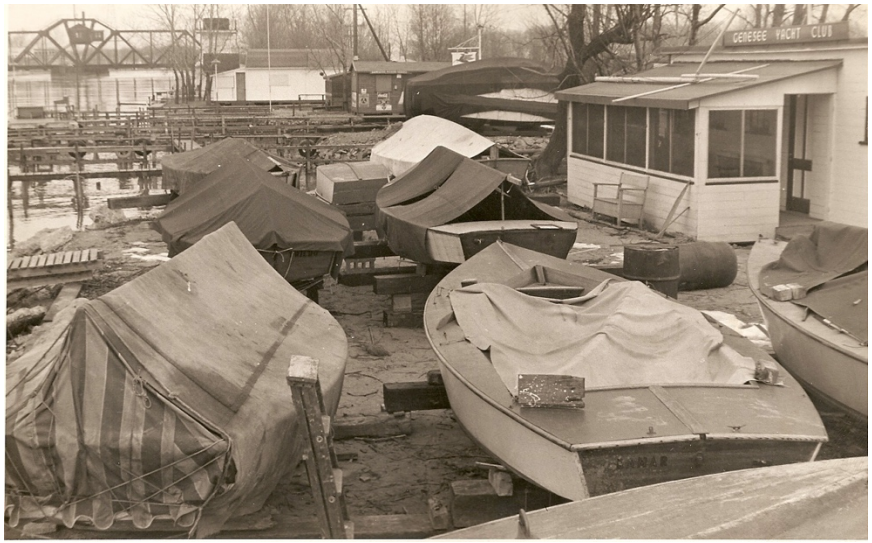
1940's - Original Clubhouse and Lightnings. Note the old train bridge and gas pumps.