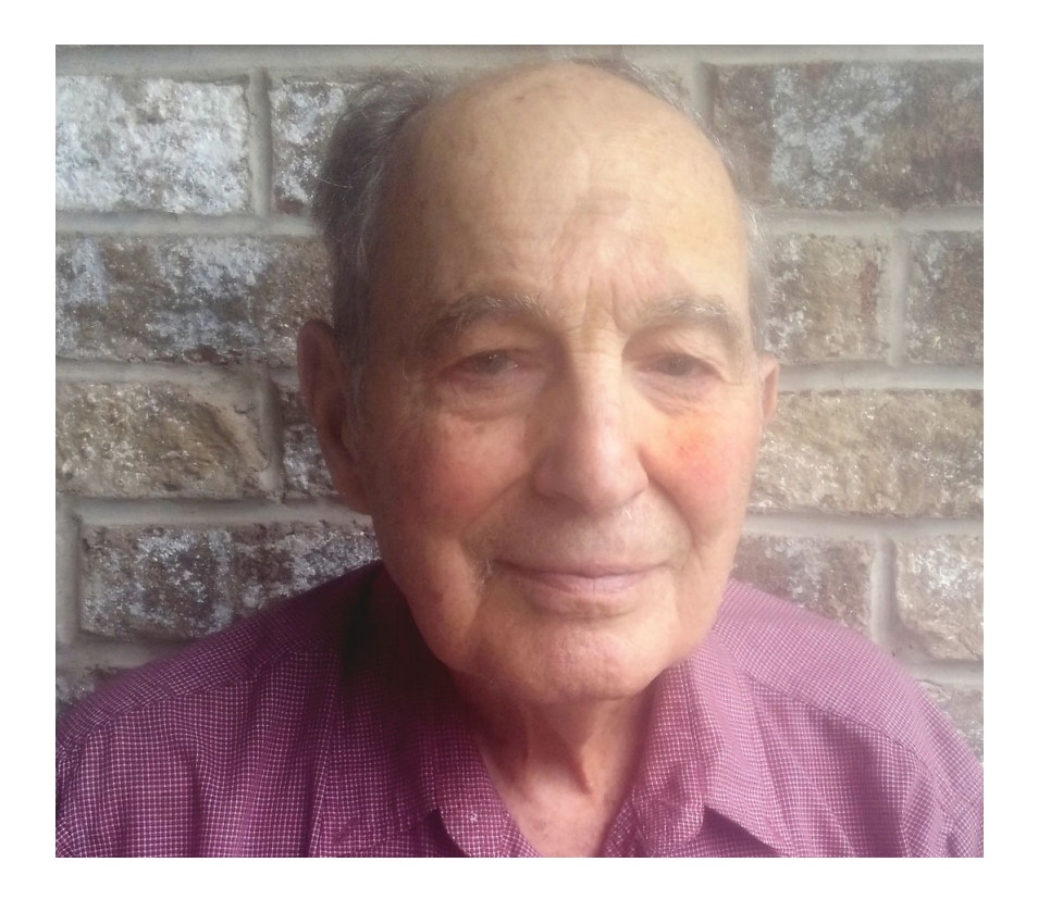
1961 to 1972 and 2022 by Donald Messina

The history of the Genesee Yacht Club can be recorded and reviewed in many ways. Instead of presenting factual, sequential descriptions of club events, it is equally and sometimes more important to just immerse ourselves in the personalities, characters of a few members, past and present.