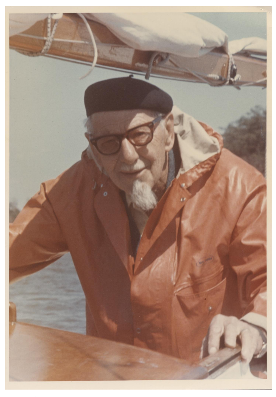
Advisor/Captain: Sea Scout Ship #39, Genesee River (ca. 1970's)