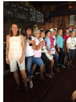
Ladies that skipped the boats in this regatta